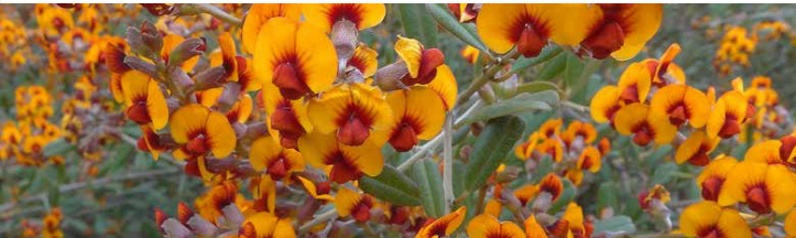
Top red-capped robin. Top right Visitors at interpretive sign. Above Gastrolobium parviflorum. Far right Numbats.