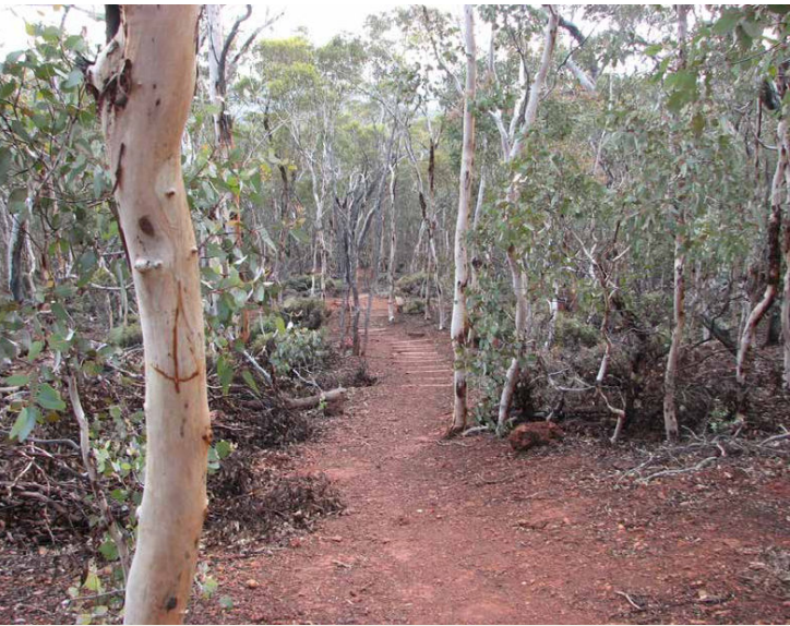
Above Ochre Trail.