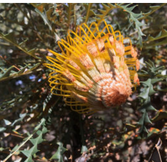
Below Golden dryandra ( Bankia nobilis ). Right Parrotbush ( Dryandra sessilis ).