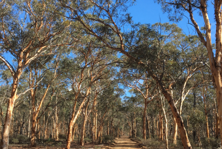
Above Powderbark woodland, Wandoo Track.